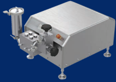
Lab and Pilot Scale (Process Testing)