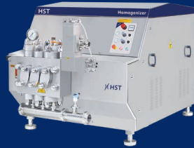
HLE Series (Budget Conscious)