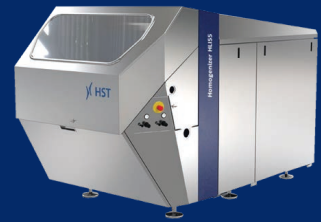
HLI Series (Integrated Drive)