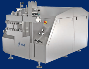
HL Series (Robust Design)