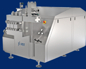
HL Series (Gaulin Design)