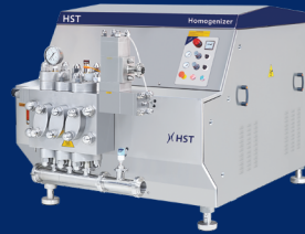
HLE Series (Budget Conscious)