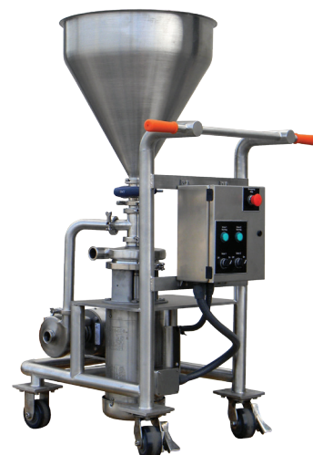
AC+ Dry Blender System